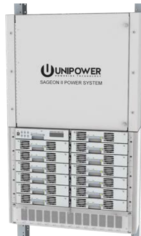
Sageon II PMD